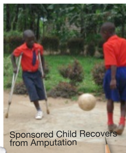
Sponsored Child Recovers from Amputation