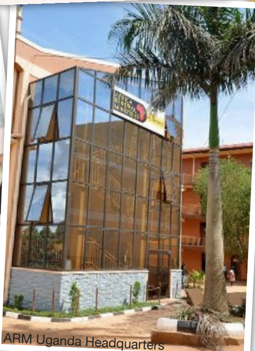
ARM Uganda Headquarters