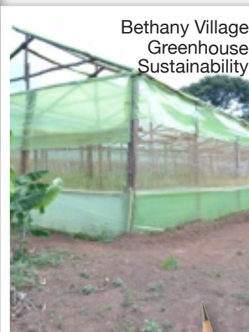
Bethany Village Greenhouse Sustainability