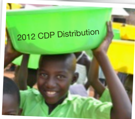
2012 CDP Distribution