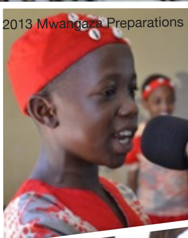
2013 Mwangaza Preparations

“And let us not grow weary of doing good, for in due season we will reap, if we do not give up. So then, as we have opportunity, let us do good to everyone.”