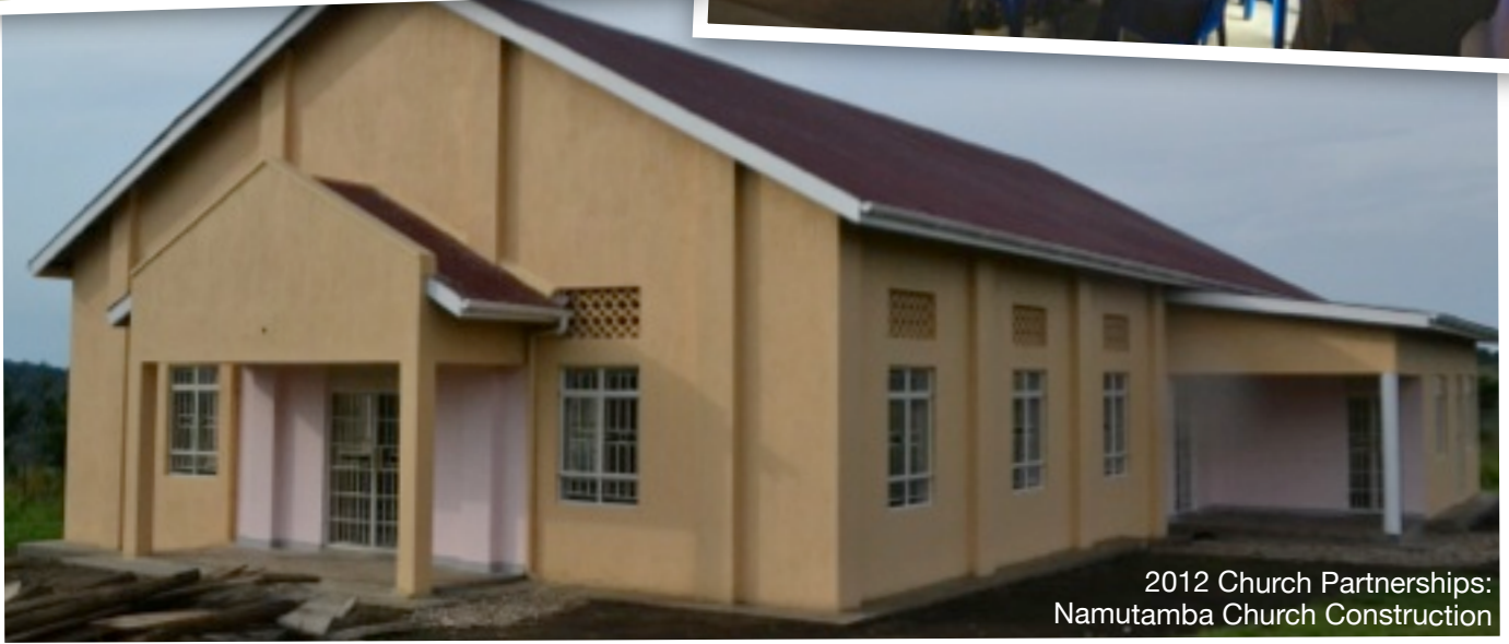
2012 Church Partnerships: Namutamba Church Construction

Friends, the stories and testimonies from 2012 are many! We share them with you because without you, many of these testimonies would not have been possible. You have prayed for us, and many of you have financially supported ARM and its ministries. More than 200 of you have taken the journey to come and serve with