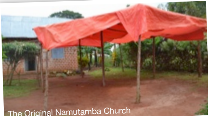
The Original Namutamba Church