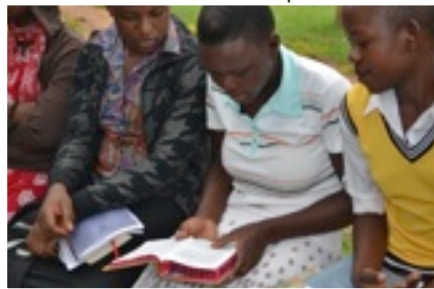
2012 Junior Youth Camp

Friends, the stories and testimonies from 2012 are many! We share them with you because without you, many of these testimonies would not have been possible. You have prayed for us, and many of you have financially supported ARM and its ministries. More than 200 of you have taken the journey to come and serve with