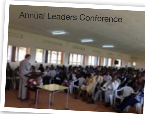
Annual Leaders Conference