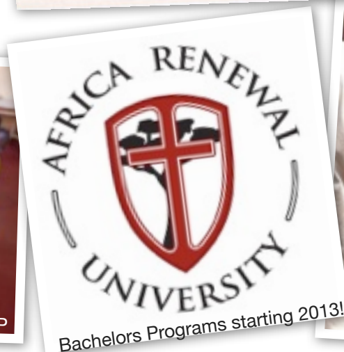
Bachelors Programs starting 2013!