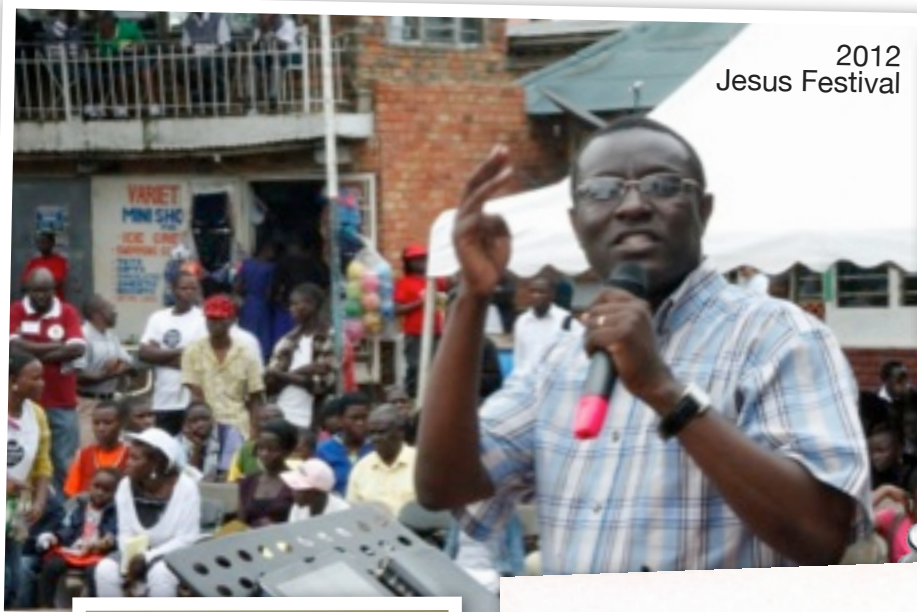
2012 Jesus Festival