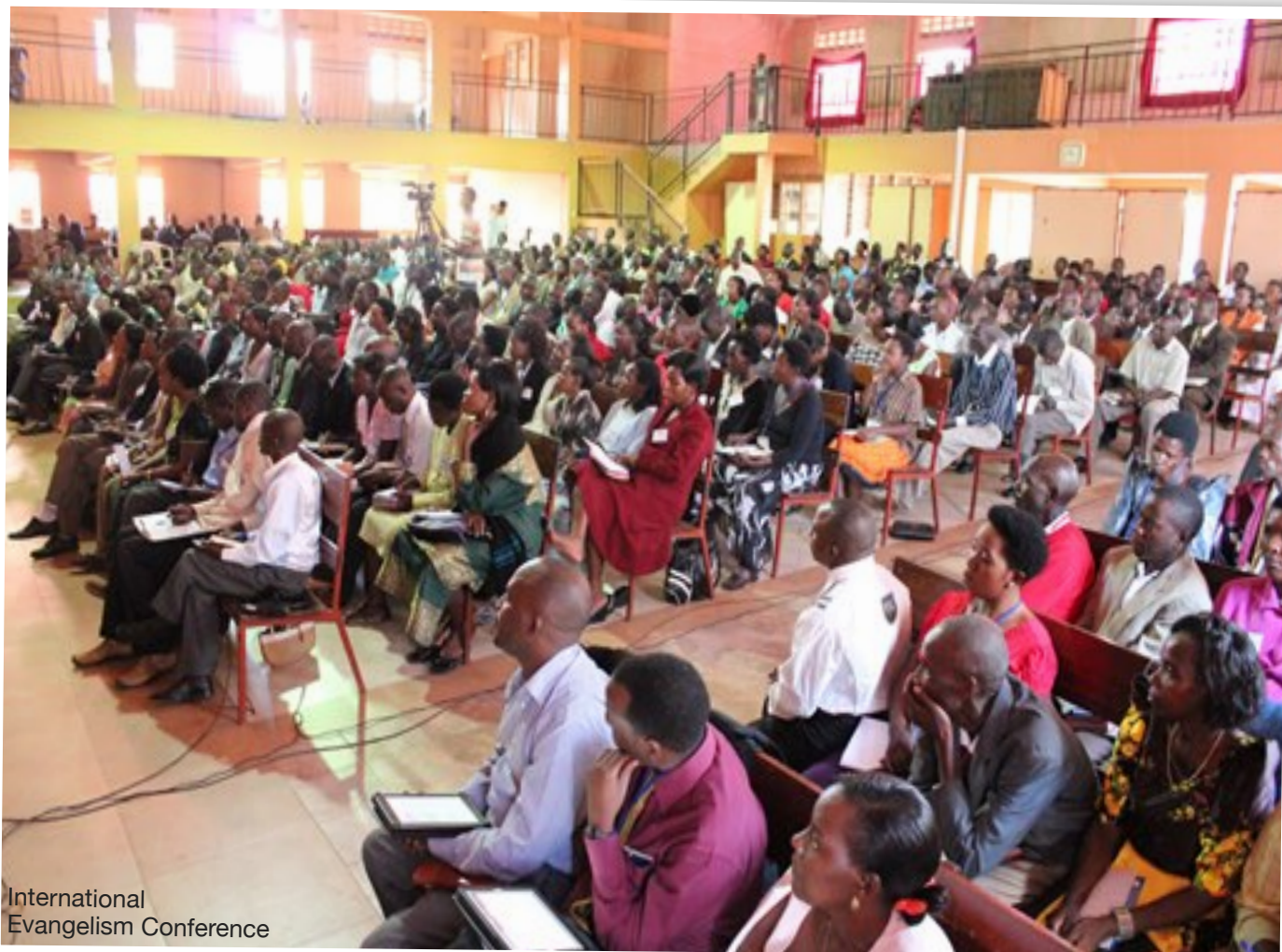
International Evangelism Conference