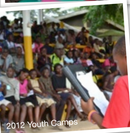
2012 Youth Camps