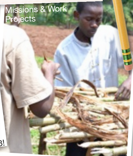
Missions & Work Projects

2013 will bring many great things! Mwangaza, our Children's Choir is traveling through the USA January to June to serve the Lord among some of your churches.