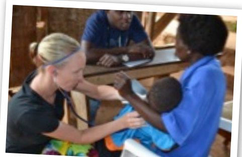
Wentz Medical Missions