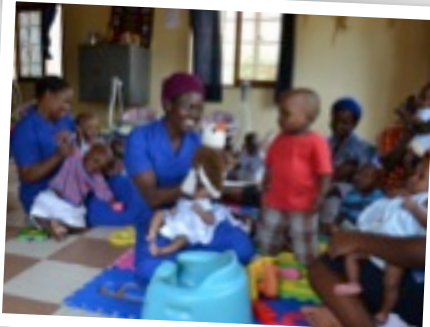
Loving Hearts Babies Home

Gaba church continues to have a parental role amongst our sister churches and it has been exciting for me to visit several of our sister churches this year. Our fellowship of churches is now 284 churches strong!