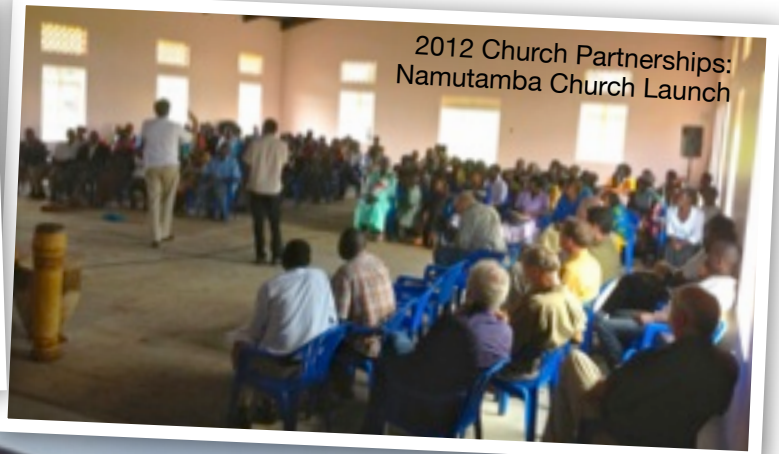
2012 Church Partnerships: Namutamba Church Launch