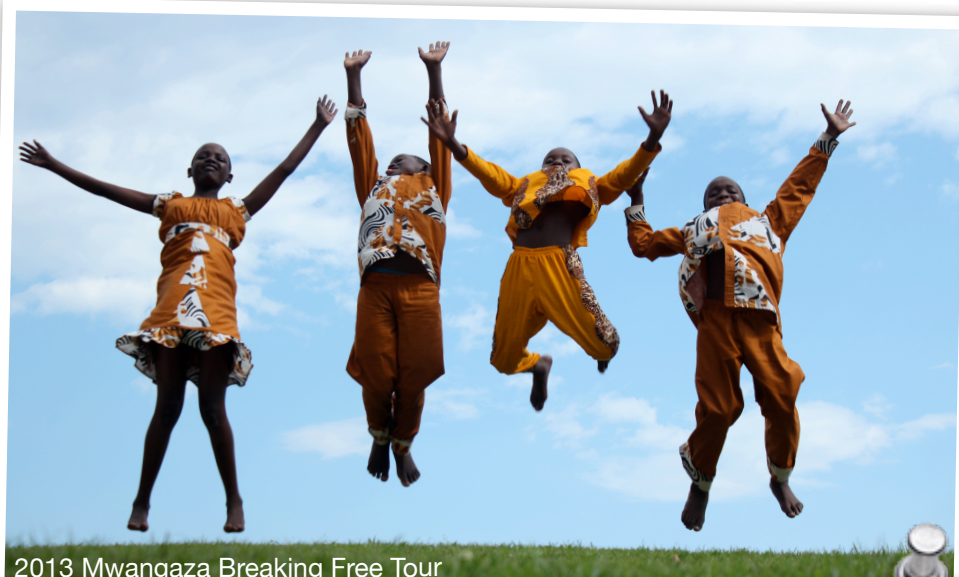
2013 Mwangaza Breaking Free Tour