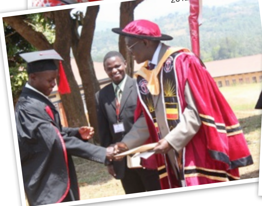
2012 ARCC Graduation