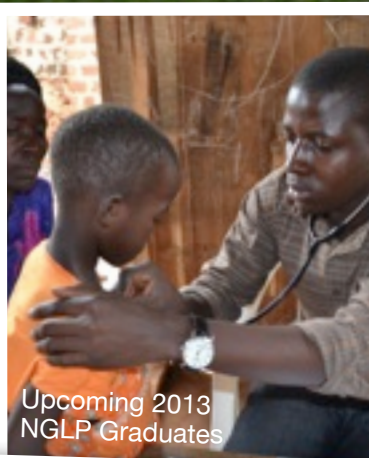
Upcoming 2013 NGLP Graduates