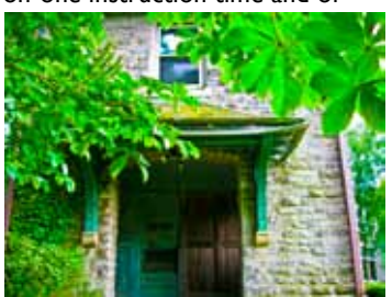
Katie Weiser, Graystone Society Explore Photography with Teresa Salinas

Wednesdays Oct 2 – Nov 20 5 – 7 pm, Free