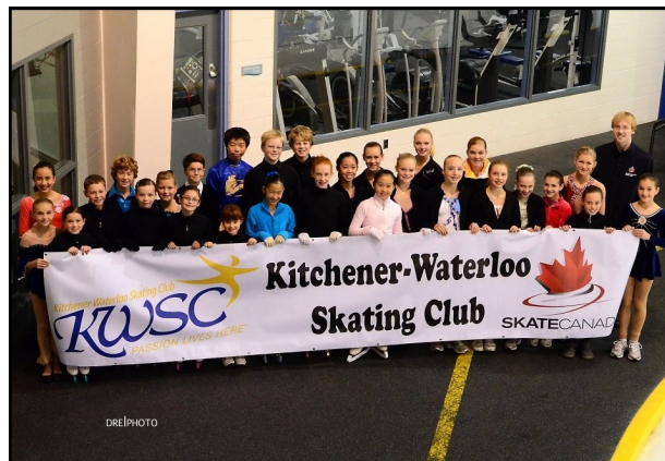
Skaters who participated in the Sectionals send off October 22, 2011