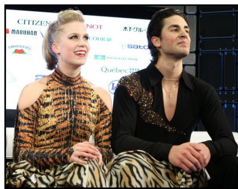
Kaitlyn Weaver & Andrew Poje finish 4th at Grand Prix final with two spectacular skates.

Good Luck to our skaters who will be representing KWSC at the 2012 Nationals Championship hosted in Moncton N.B January 16—22, 2012