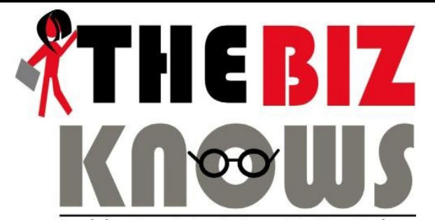
Providing Knowledge & Support for Your Business