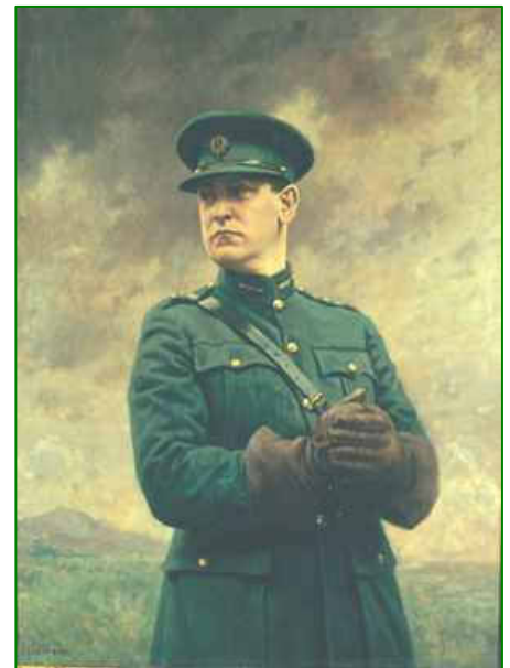
The Big Fella – Michael Collins

outstanding and the overall mouthfeel of the spirit is just divine. The peat and smoke notes give the spirit a nice complexity and depth that makes it a perfect sipping whiskey. It may not be exactly what people are expecting from an Irish whiskey, but we think those who do venture out and try it will be pleasantly surprised.