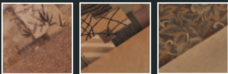
Turkish Coffee Fall River Cappuccino

Your all new outside kitchen will be the envy of the neighbors. You'll never have to be cooped-up inside again.