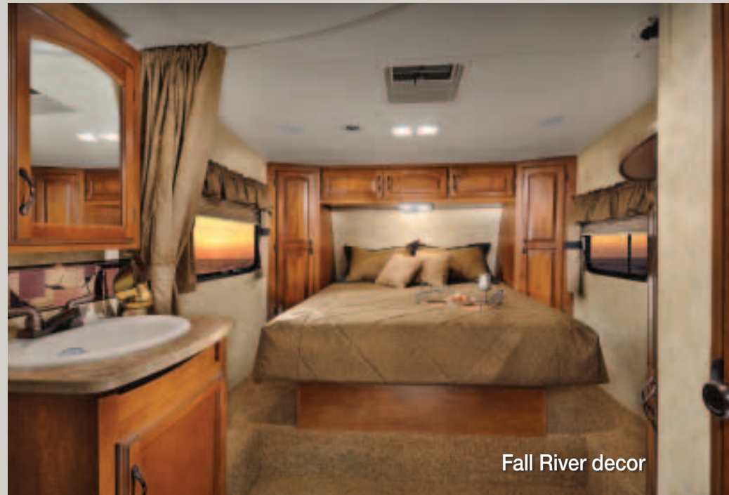
Fall River decor