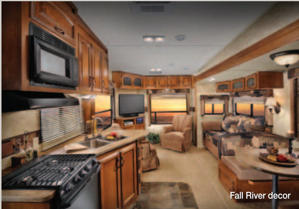
Fall River decor

our full-sized queen beds (80" x 80"), or our bigger Pack Max Storage system all designed to make sure your RV time is quality time.