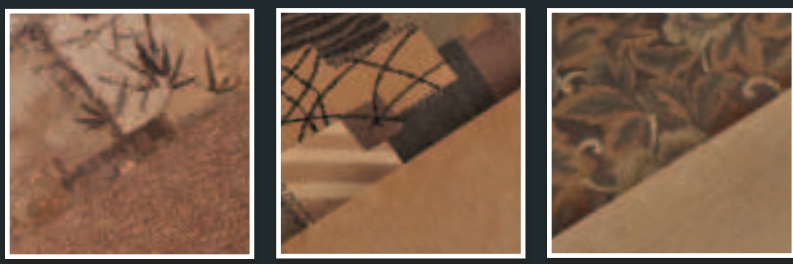
Turkish Coffee Fall River Cappuccino

Your all new outside kitchen will be the envy of the neighbors. You'll never have to be cooped-up inside again.