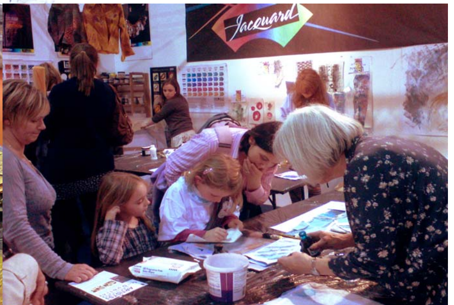
Images from the Artists in Action stands in Dublin and Harrogate 2011

ART VAN GO, The Studios, 1 Stevenage Rd, Knebworth, Herts SG3 6AN Tel: 01438 814946 www.artvango.co.uk