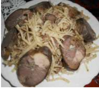
Uzbeki Naryn, horse meat dried with cumin, Aladdin Restaurant, NYC.

There is at least one restaurant in the U.S. serving horse meat in New York City. A food blog, the United Nations of Food (20), raved about an Uzbeki dried horse meat with cumin dish served at a new Armenian restaurant in Sheepshead Bay. “Even more awesome: one of our salads was an appealing little number called naryn, made