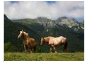
These French horses are from one of nine rare heritage breeds of heavy horses that are preserved in France because they are used for food. (32)

Americans eat horses. Some Americans eat horses today, and more would do so if it was available as it is in most of the world. For more than three-quarters of the cultures of the world, horse meat is just another culinary choice that is safe, nutritious, and delicious, right alongside the beef, pork, chicken, and fish in the meat counter. It is widely available in Canada and Mexico, and currently the majority of horses processed in both neighboring countries originate from the United States.