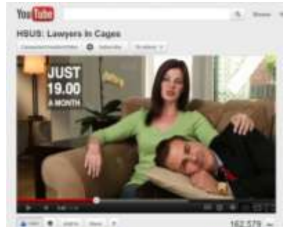
More needs to be done to expose the unethical practices engaged in by extremist groups like this clever video. (38)

The inevitable and immediate result is that horses suffer. Horses suffer tragically in huge numbers. People who depended on horses for their living, the families of breeders, trainers, veterinarians, farriers, stable owners, feed growers, equipment suppliers, all see their chosen and beloved profession become impossible to maintain, and the industry liquidates. Without a residual market for horses, the entire market collapses.