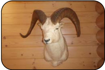
Multiple Wildlife Mounts & Rugs

Preview: Friday June 15, 2012 10:00 - 5:00pm