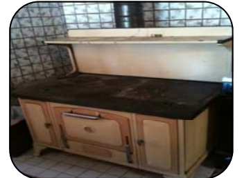
Antique Wood Burning Cook Stove & many more Antiques!

26Ton Yard Machine log splitter—used once, Craftsman 9.0hp shredder, 4000 Watt Champion generator, All types of yard tools, battery chargers, Lincoln wire feed welder, drafting tables and equipment, ladders & other tools.