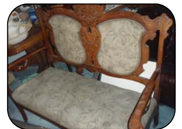
All types of Antique & household furniture

Brand new "Box" wood stove w/ 6" pipe, 2 upright freezers, 1 chest freezer, 3 refrigerators, Kenmore electric washer & dryer, Maytag Neptune electric washer & dryer, Kenmore gas range & matching microwave, vacuum cleaners, microwaves, dishwasher, 60" Mitsubishi HD 1080 TV and more.