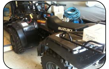
1997 King Quad with only 144 Miles—Snowplow included

Dall Sheep head, Lynx rug, Brown Bear rug, Black Bear rug, Caribou Antler mount, 10' piece of Baleen, Deer head mount, Pheasant mount, Peacock mount, Caribou hide