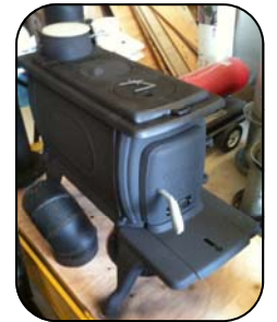
Brand new "Box" Wood Stove

Large Cannon gun safe w/ combo, sleeping bags, 9 boxes of clay pigeons and thrower, rifle stand, Ammunition: 9mm, 30-30, and .22, fishing reels, fishing nets, camp chairs, and other hunting and camping gear.