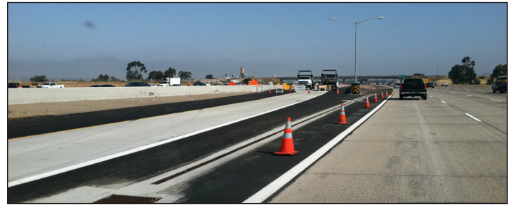
New entrances to the Express Lanes, like this one at Miramar Way, will open on June 27th.

That particular entrance will be important for drivers coming from Carmel Mountain Road and Camino Del Norte. Temporarily, they'll have to use it. The entrance ramp they've taken, on the