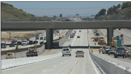
Work near Poway Road bridge is expected to be finished soon.

We're excited about the progress we're making on the I-15 Express Lanes project. While work continues, much of it is being completed ahead of schedule. In the South Segment, the Carroll Canyon