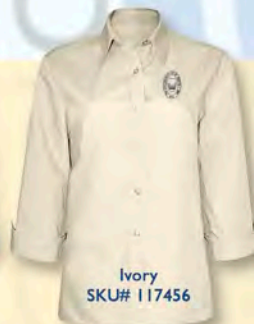
Ivory SKU# 117456