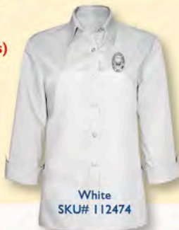
White SKU# 112474