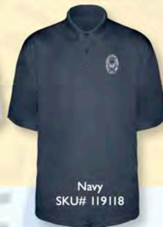
Navy SKU# 119118