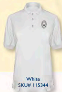
White SKU# 115344