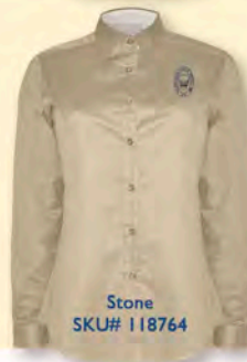
Stone SKU# 118764