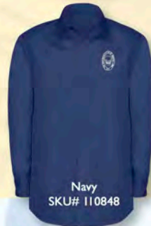
Navy SKU# 110848