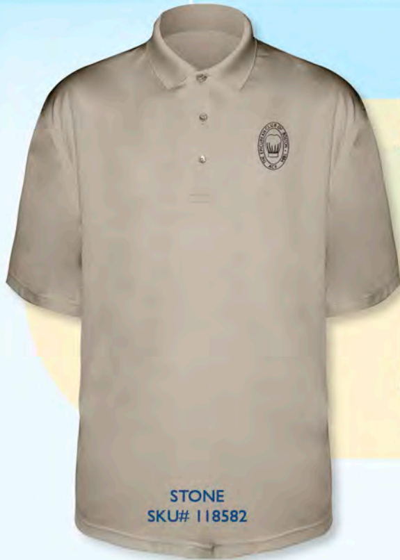
STONE SKU# 118582