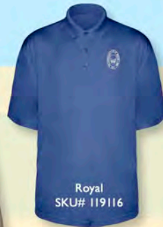
Royal SKU# 119116