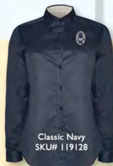
Classic Navy SKU# 119128

COST: $29.99ea. (XS-XL) (Additional Cost for Larger Sizes)