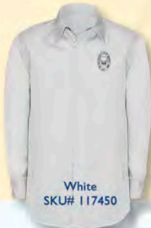
White SKU# 117450