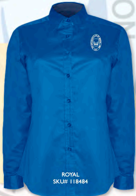
ROYAL SKU# 118484