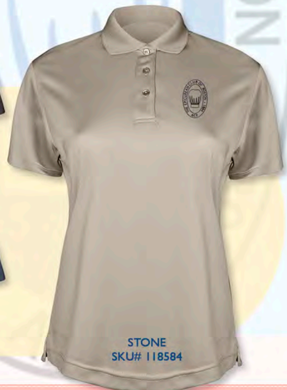
STONE SKU# 118584