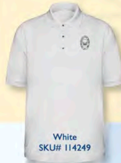
White SKU# 114249