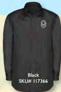
Black SKU# 117366