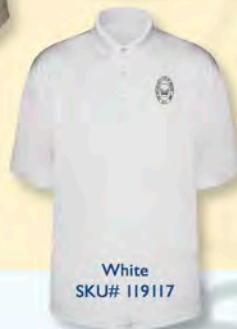
White SKU# 119117