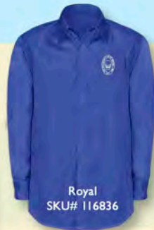
Royal SKU# 116836