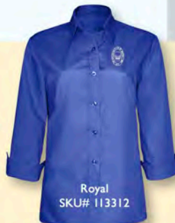
Royal SKU# 113312