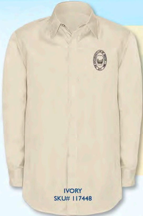
IVORY SKU# 117448