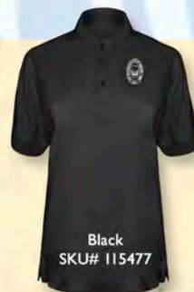
Black SKU# 115477