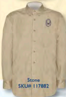
Stone SKU# 117882