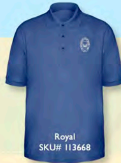
Royal SKU# 113668