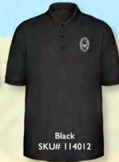
Black SKU# 114012