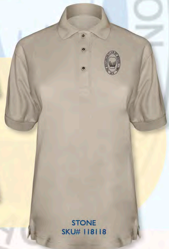
STONE SKU# 118118