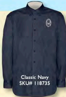
Classic Navy SKU# 118735