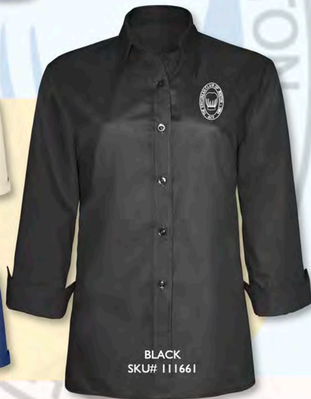
BLACK SKU# 111661