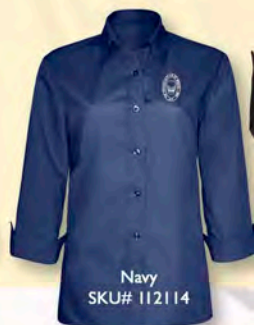
Navy SKU# 112114