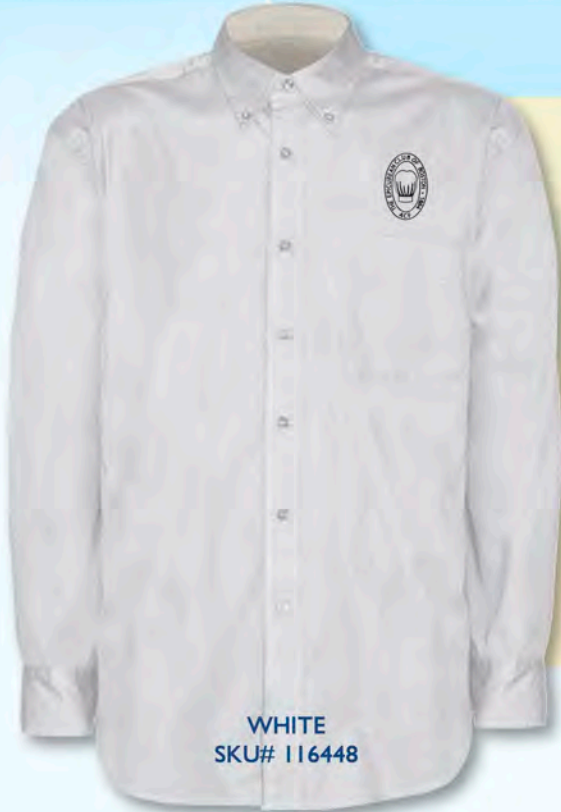
WHITE SKU# 116448