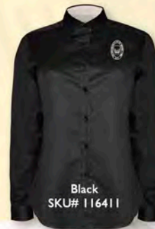
Black SKU# 116411