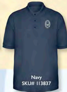
Navy SKU# 113837