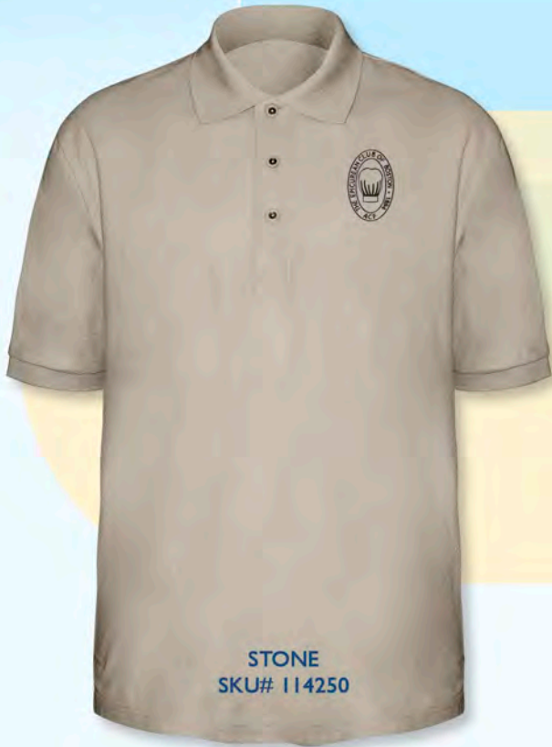
STONE SKU# 114250