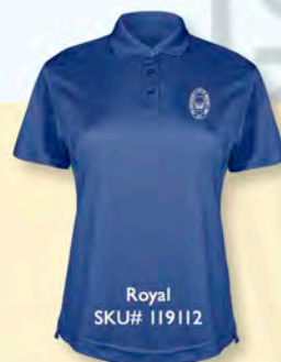
Royal SKU# 119112

COST: $35.00ea. (XS-XL) (Additional Cost for 2XL-4XL)