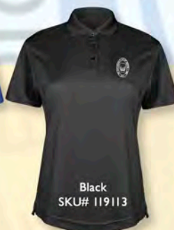
Black SKU# 119113