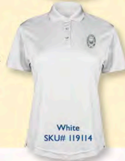
White SKU# 119114