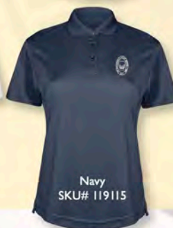
Navy SKU# 119115