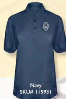
Navy SKU# 115931