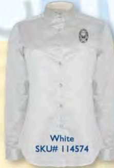
White SKU# 114574