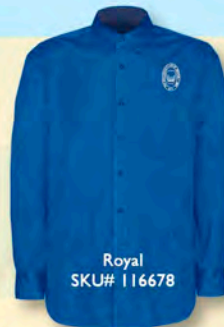
Royal SKU# 116678