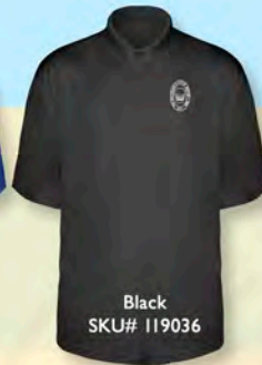
Black SKU# 119036