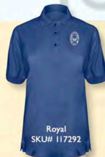
Royal SKU# 117292

COST: $22.50ea. (XS-XL) (Additional Cost for 2XL-10XL)