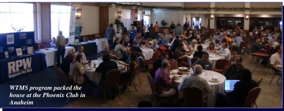
WTMS program packed the house at the Phoenix Club in Anaheim