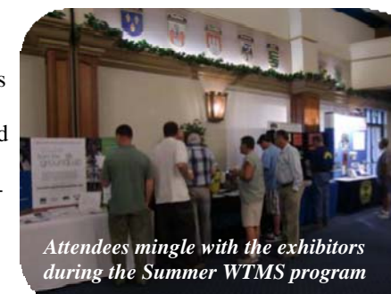
Attendees mingle with the exhibitors during the Summer WTMS program