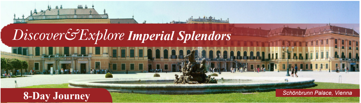
Schönbrunn Palace, Vienna