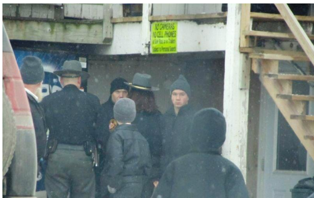
Police Officers and sign at auction entrance

Two police cars parked in the parking lot. At the entrance to the auction barn, three officers from the local Sheriff's Department were observing everyone entering the auction. Signs were posted: "No cell phones or cameras in auction ring and trailers; subject to personal search"