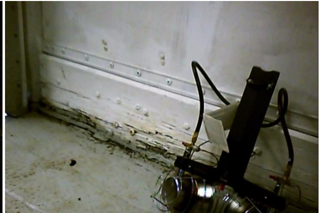
Double tank heating element with no tank in trailer #2