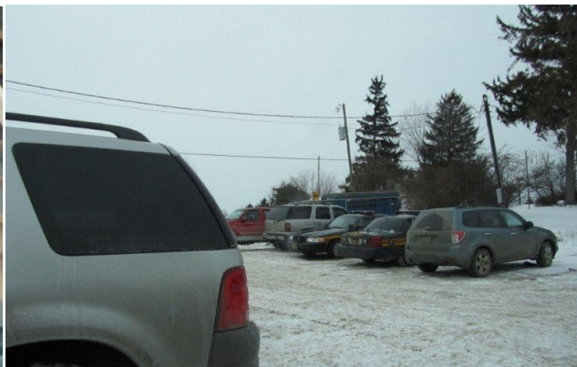
Police cars in parking lot

Auction visitors were allowed to look at the dogs before the sale starts. The dogs were kept in three 48 ft long and 13ft 6 inches high trailers. Four rows of cages were stacked on top of each other. In each trailer, a small propane heater was running. However, it was a very cold day and every time one of the trailer doors opened, more cold air came in. In two of the trailers, the propane tanks temporarily ran out of propane. Several dogs were observed shivering, especially in the bottom rows of the cages.