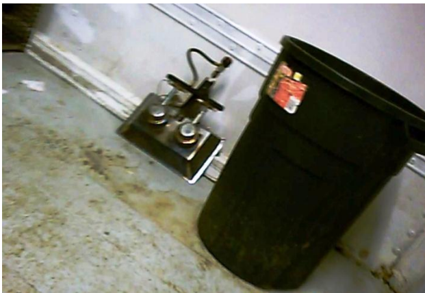
Double tank heating element with no tank trailer #3