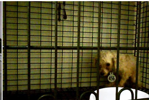
Poodle shaking in corner of cage