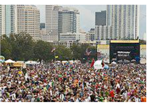
SOUTH BY SOUTHWEST