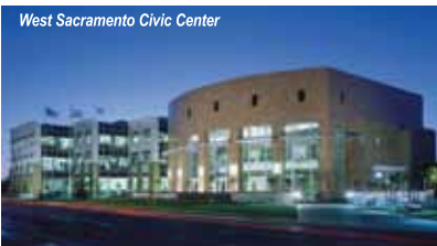
West Sacramento Civic Center