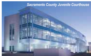
Sacramento County Juvenile Courthouse