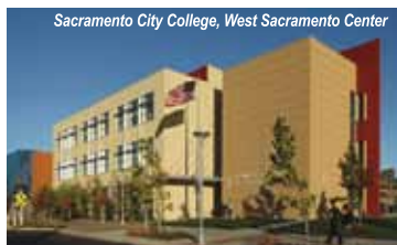
Sacramento City College, West Sacramento Center

ELEVATE THE HUMAN EXPERIENCE THROUGH DESIGN