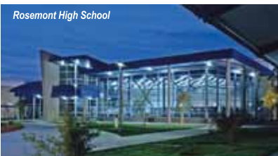
Rosemont High School