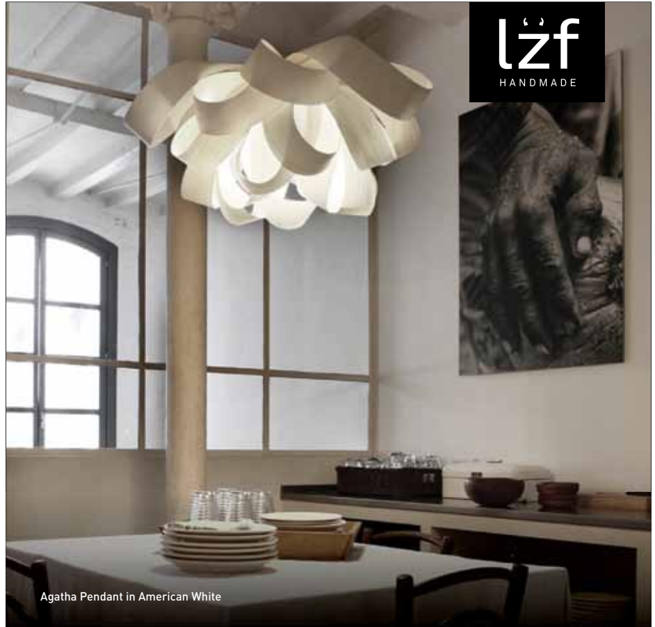
Agatha Pendant in American White

Curious about the design process? Ever wanted to work with an architect but were not sure what services they provide? Here is your chance to find out. The diverse AIA Central Valley Member firms are opening their doors to the general public for a casual evening open house. Meet and talk with architects, tour their offices and workspaces