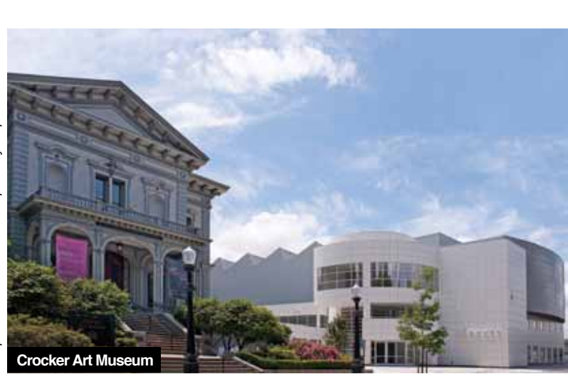
Crocker Art Museum