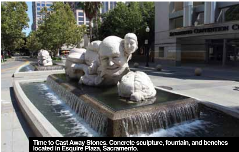
Time to Cast Away Stones. Concrete sculpture, fountain, and benches located in Esquire Plaza, Sacramento.

Stops include: East End Complex: Golden State & Amaneceres de Sacramento ; Blue Trees Installation; Convention Center Sculpture Garden: Time to Castaway Stones ; Federal Courthouse: Installation for the Sacramento Courthouse and Gold Rush ; Riverwalk: Cloud Vessel ; CalPers Building: Serendipity and About Time 1-6 .