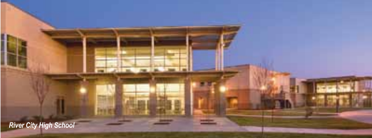
River City High School