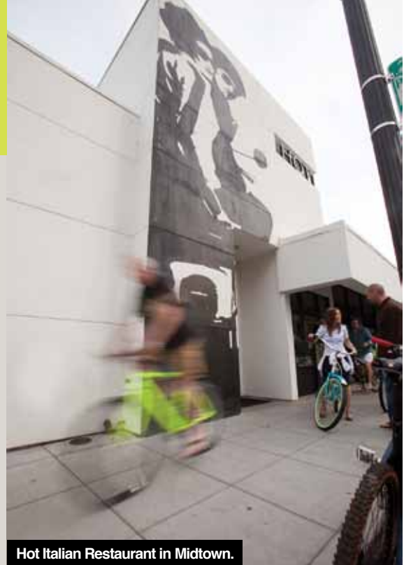
Hot Italian Restaurant in Midtown.

The Central Valley Architecture Festival kicks-off with a celebration at Hot Italian in Midtown. Throughout the evening enjoy a compendium of visuals that capture and communicate narratives of our region; sample the best of Hot Italian's menu at the unlimited pizza and beverage bar; and enjoy DJ music provided by PhonoSELECT. Plus, learn more about the festival events and activities and grab extra Sactown Festival guides to share!