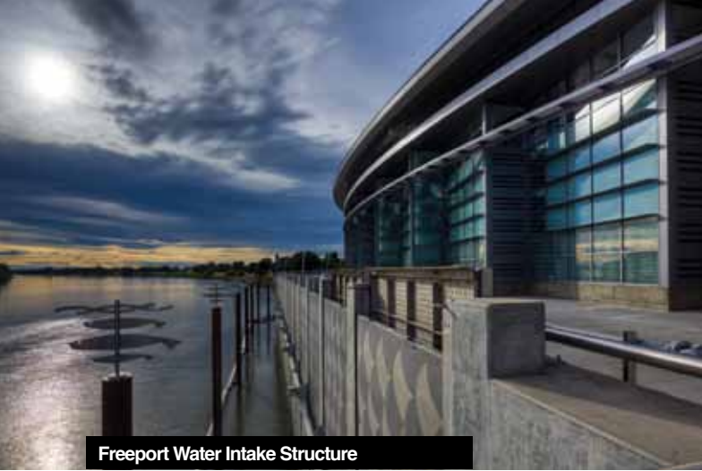
Freeport Water Intake Structure