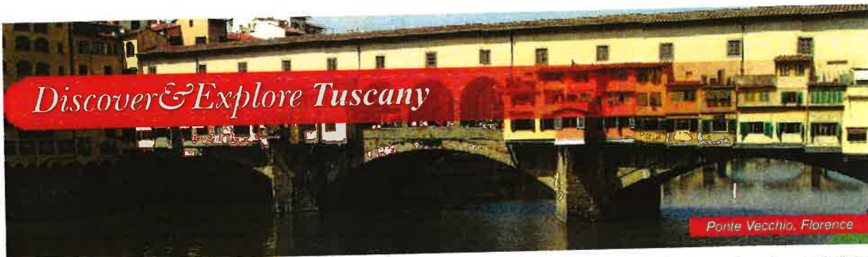
Ponte Vecchio, Florence