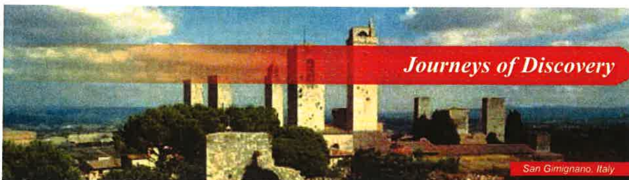
San Gimignano, Italy

famous marble quarries in the world. As you continue north, you arrive in the most picturesque cove on the Italian Riviera, Portofino. With its colorful houses and cobblestone streets, it will provide an unforgettable Mediterranean experience. You will have time to enjoy meandering through this classic Italian village before returning to your hotel. (B) (Approx: 85 Euros)