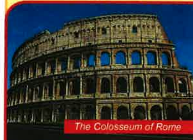
The Colosseum of Rome

LEGEND: ( ) = In-flight meal, B = Breakfast, D = Dinner, DB = Dinner Banquet