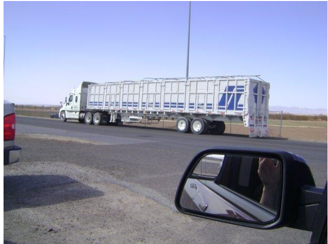
Trucks waiting to cross border with completely closed sides

The fact that the sides were closed completely is very concerning. How is the driver checking the horses during transit? Additionally, no airflow is possible through the closed trailer sides, which causes increased temperatures inside the trailer – especially when it is parked.