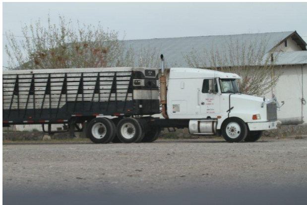
Three Angels Farms

2:10 pm: Investigators observed a truck and empty trailer owned by Dennis Chinn parked across the road from the C4 pens. (USDOT 279114, Pratt, KS)