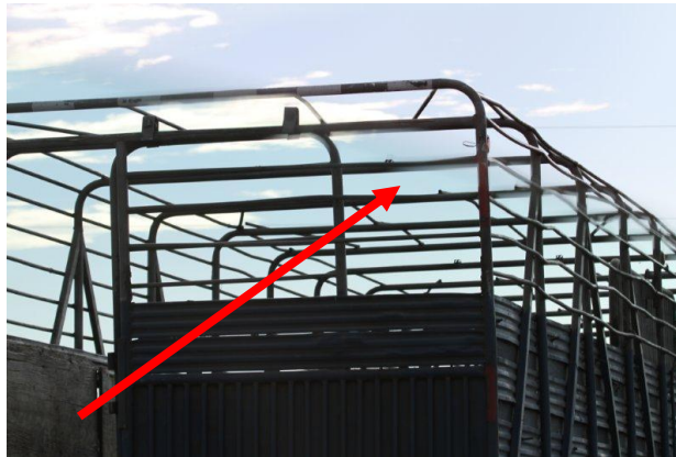
Broken & Missing overhead piping put horses at risk of severe injuries