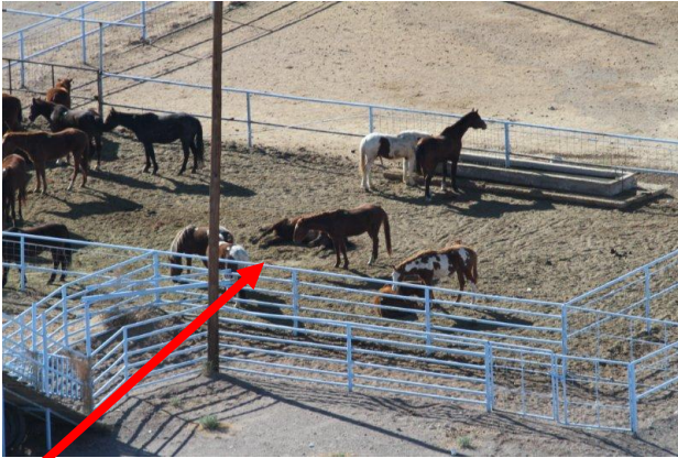
Dead horse in pen area