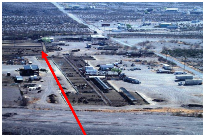
C4 Holding Pens