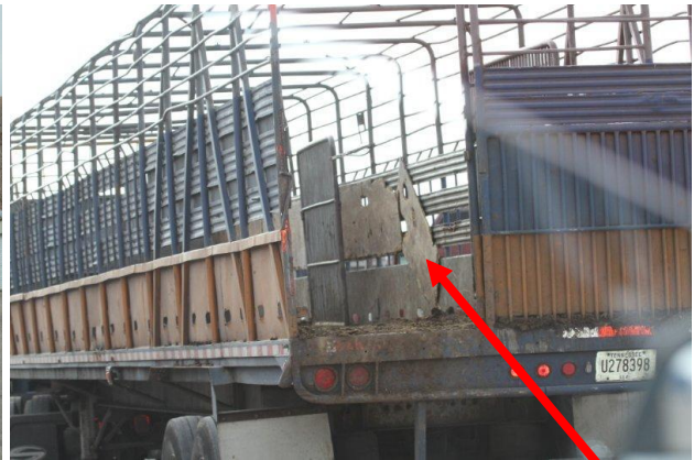
Loose boards on trailer sides, holes and exposed screws put horses at risk