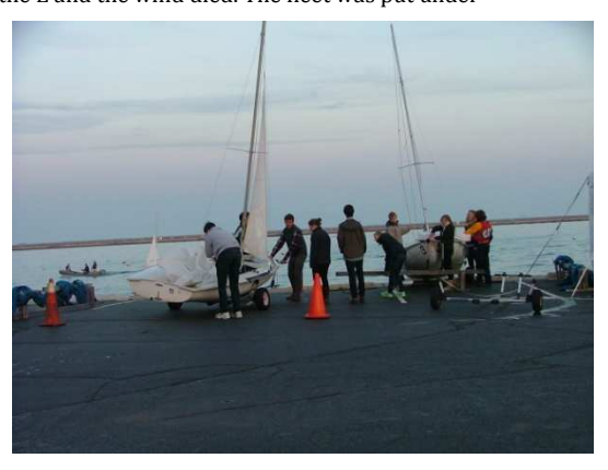
Wisconsin and Minnesota unrig on Saturday as it gets dark and the wind quits at the 2012 Timme Angsten Regatta.