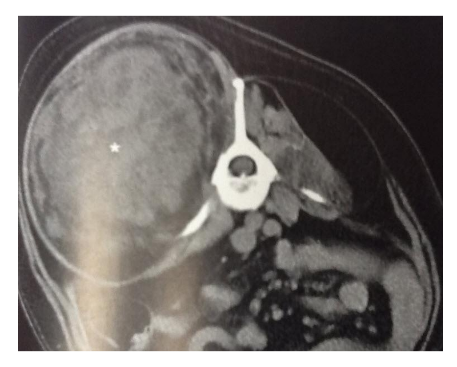
An adult dog with a liposarcoma. Transverse CT image shows an inhomogeneous mass (asterisk) at the location of juxtavertebral muscles.