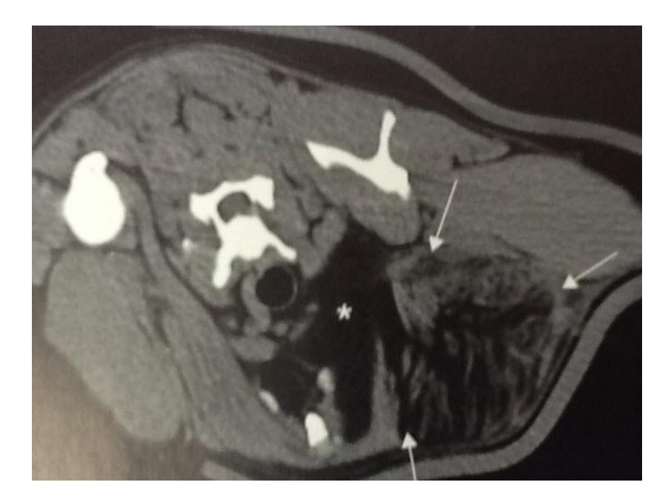
Adult dog with an infiltrative lipoma. Transverse CT image (level thoracic vertebra) shows a mass located between the trachea, the vertebral column, the triceps brachial is muscle and the ventral skin. The mass is partly homogeneous with a fat density (asterisk) and partly inhomogeneous (fat/soft tissue density). The mass is locally aggressive and infiltrates the surrounding muscle (arrows).