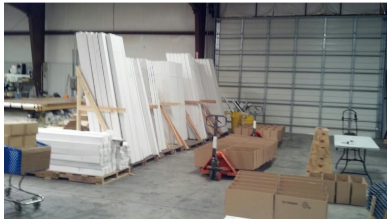
Retractable doors awaiting packaging.

*Standard lead time for orders of 20 doors or more is 10 days.