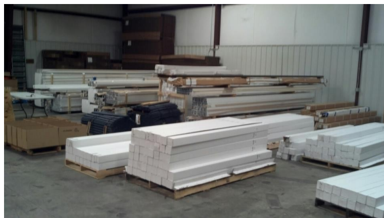
Aluminum extrusions heading to cut-line.