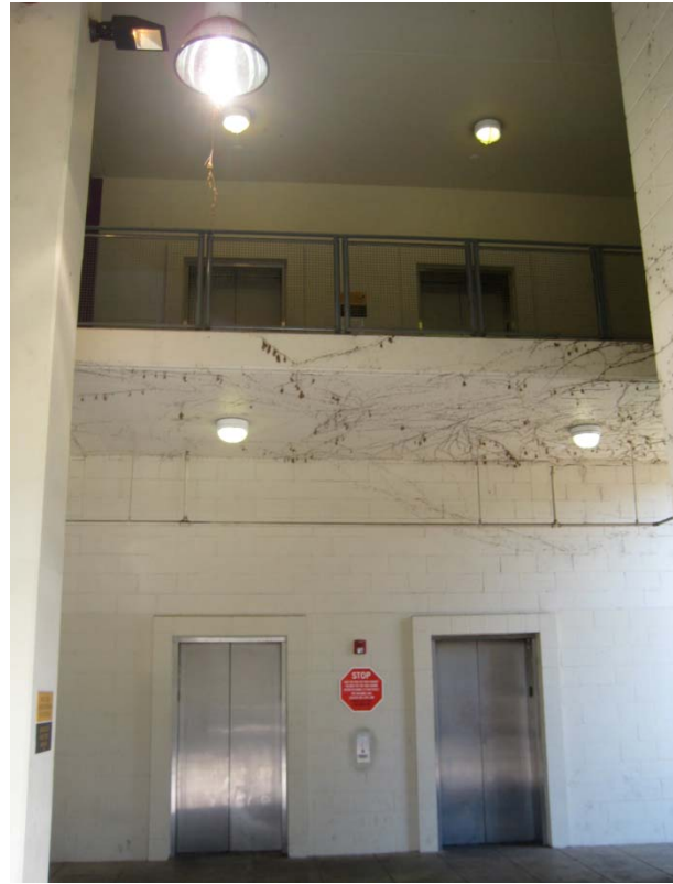
Figure 2: Interior elevator lobby, from 15th Street