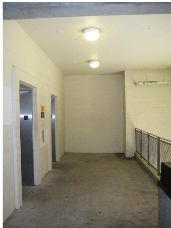
Figure 4: Interior north wall, 2 nd level