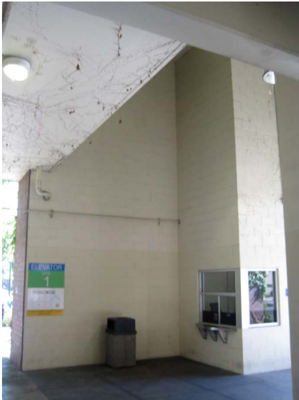
Figure 3: Elevator lobby, facing 15th Street