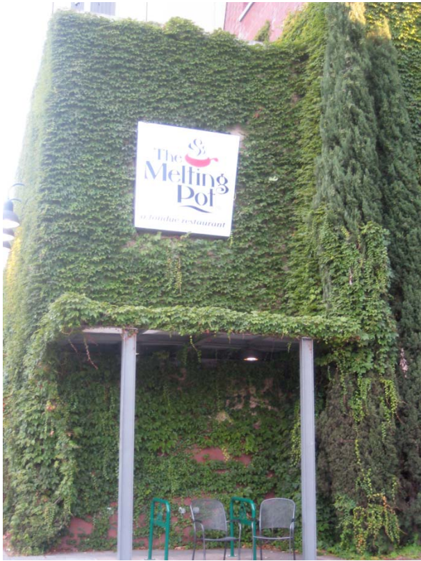
Figure 1: Arbor area facing H Street patio