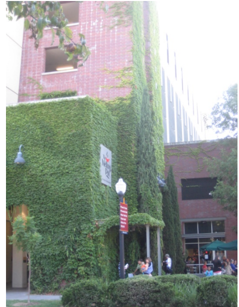
Artwork site on northwest corner