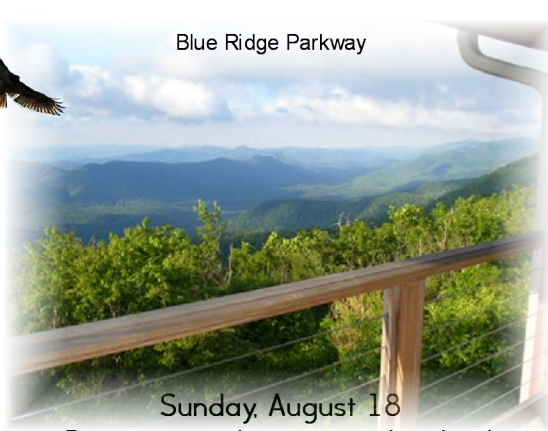
Blue Ridge Parkway