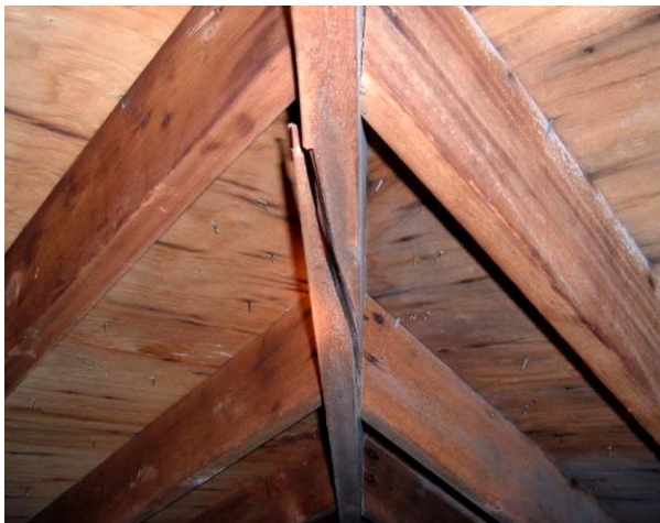
Broken roof structure

How bad is the exposed (or hidden) electrical work and ductwork in your attic?