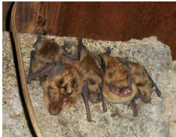
Bats living inside an attic