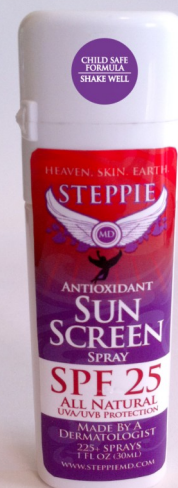
SteppieMD Sunscreen Spray

Botox and IPL Laser patients must have consult before treating.