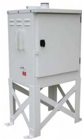
Four-leg Stand Powder-coated steel stand for 10-gallon models