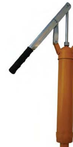
Steel Hand Pump

Select hand pump assembly based on material.