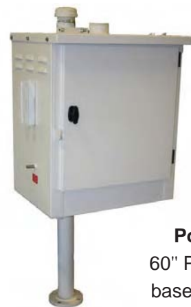
Post Mount 60" Post with cap, base, and U-bolts