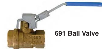
691 Ball Valve

Full port NPT ball valve with brass body, hard chrome plated ball, Teflon® seals