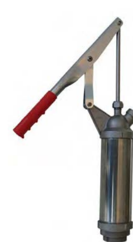
Stainless Steel Hand Pump