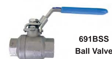
691BSS Ball Valve

Full port NPT ball valve with brass body, hard chrome plated ball, Teflon® seals