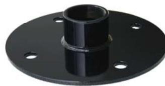
Fig. 610 Standard Base 610B--0100 WAPB