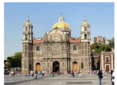
Basilica of Our Lady of Guadalupe

Eighty-four pilgrims (including 6 priests) representing 25 Magnificat Chapters traveled to see Our Lady of Guadalupe and other holy sites in November. To see the people, places and experiences of this wonderful grace-filled pilgrimage, go to www.magnificat-ministry.net/guadalupe-trip/pilgrims-travel-blog/ . More information on this memorable journey will be featured in our next newsletter!