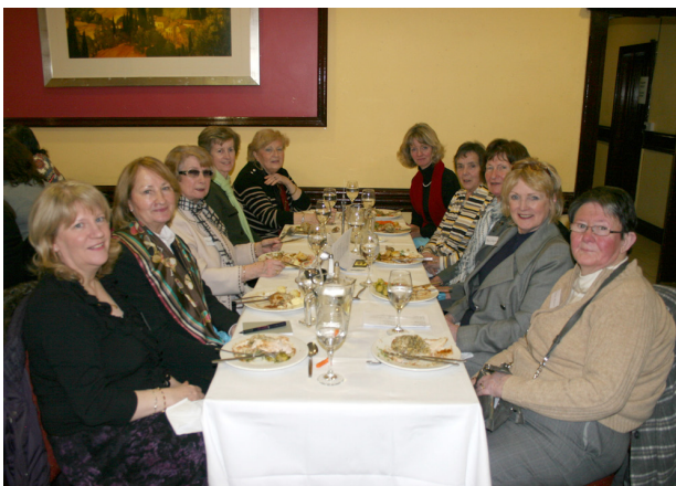
Dublin, Ireland's First Magnificat Meal