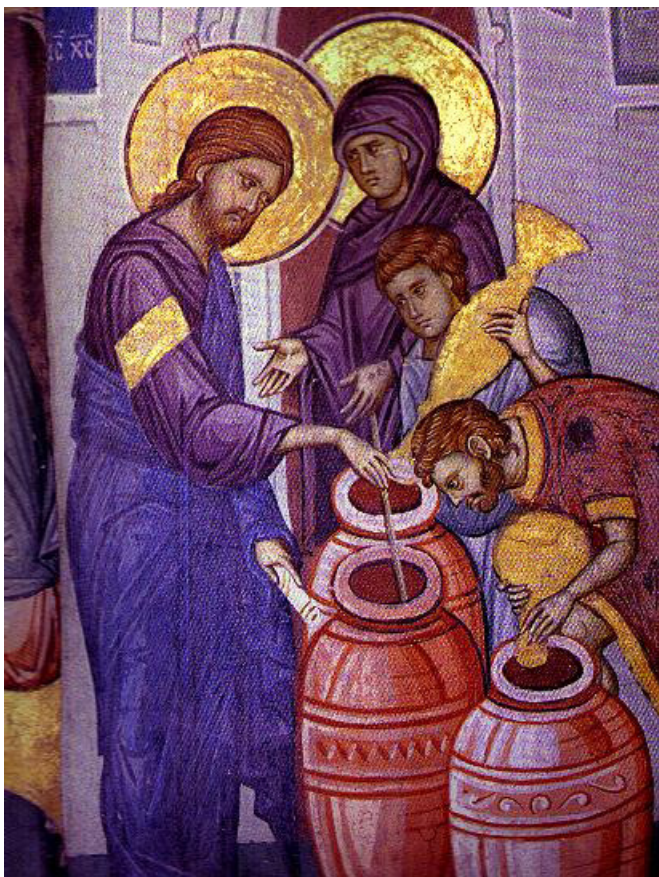
Theme: The Wedding Feast at Cana