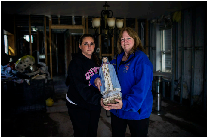
Statue of the Blessed Mother one of the only items to be saved in house on Staten Island

Many of our Magnificat members live near or on the water and everyday I am hearing news of another family who lost everything - the towns of Long Beach, Oceanside, Freeport, Merrick and Massapequa were especially hard hit and this is where many of our Sisters live and work. Schools were closed for almost two weeks - and some are still not open. Electric power has been slow to come back and as of today, two weeks since the storm, there are still people living without light or heat. Our local parishes immediately stepped into gear and people from all over began to bring clothing, food, cleaning supplies and the like to parish centers where everything was sorted.