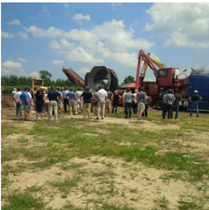
Attendees gather around the Gro-Bark Grinder for a discussion on utilising organic nursery waste to create organic compost for use in the field operations at Connon NVK