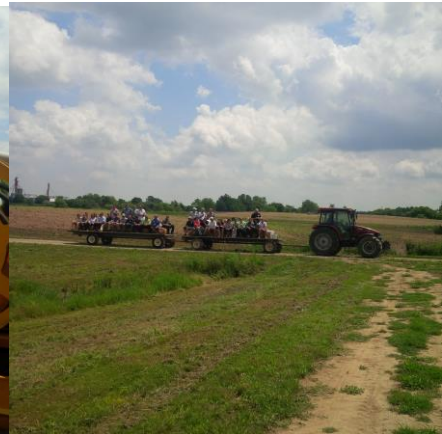
A leisurely wagon ride on one of two sets of wagons through the pot in pot and field operations.