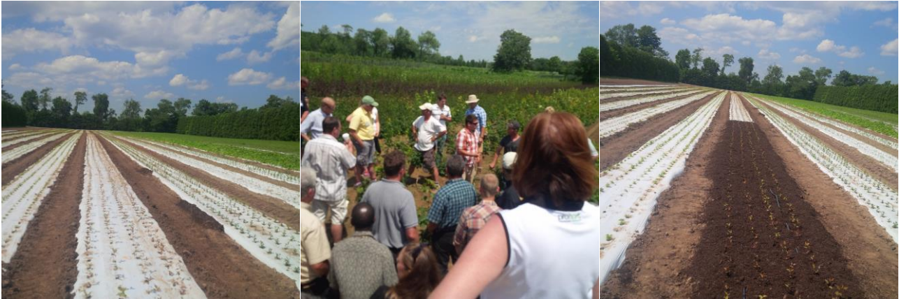
White plastic normally used as weed control for liner stock.