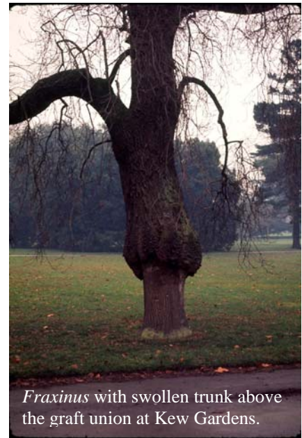
Fraxinus with swollen trunk above the graft union at Kew Gardens.

There are many complex factors that can lead to graft failure besides incompatibility, including poor workmanship and disease. All of us will observe this at one time or another. When this failure is delayed for a long period of time, a bell shaped swelling or a ridge of rough bark may develop at the graft union. This should not be confused with overgrowths that can occur above the union as I have seen at Kew Gardens in an extraordinary Fraxinus angustifolia 'Pendula' or below the union, which is very common in conifers.