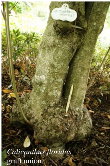
Calicanthus floridus graft union.

formed at the bottom of the union. I suspect that the cut on the scion was longer than that on the understock, thus the healing occurred without being able to attach itself at this point.