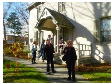
Scenes from Hartford...click here for slide show