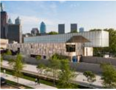
The Barnes Foundation

The Barnes Foundation, Philadelphia, Pennsylvania