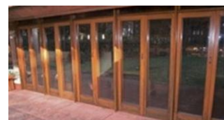
Zimmerman House loggia doors after conservation