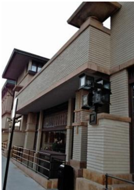
The Historic Park Inn

For Mary's slide show of the conference and many FLW buildings, click here