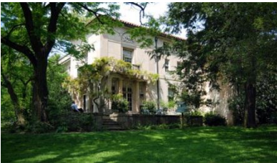
Dr. Barnes Residence Merion, Montgomery County

Visiting the new Barnes Foundation is like meeting an old friend after a long hiatus. On the outside there are visible changes, but on the inside everything is just as it always was. What a joy to pick up where you left off.