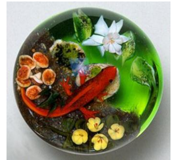
Red Salamander Swamp Series Paperweight Rick Ayotte